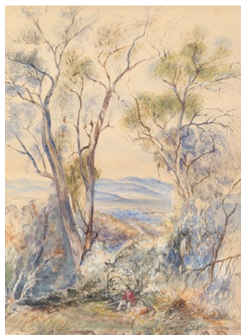
JOHN SKINNER PROUT Hobart Town from Knocklofty 1845